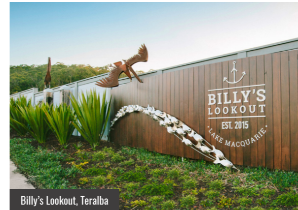
Billy's Lookout, Teralba