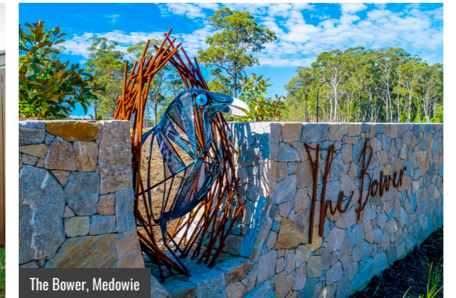
The Bower, Medowie

“ From the moment you drive in to Billy's Lookout, the quality speaks for itself and you know it is something special. From the statues of two massive Pelicans, to the detail which has been put into selecting the shrubs which line the streets, it is evident that not a dime has been spared. McCloy Group hasn't simply created a heap of blocks of land, but an amazing community. ”