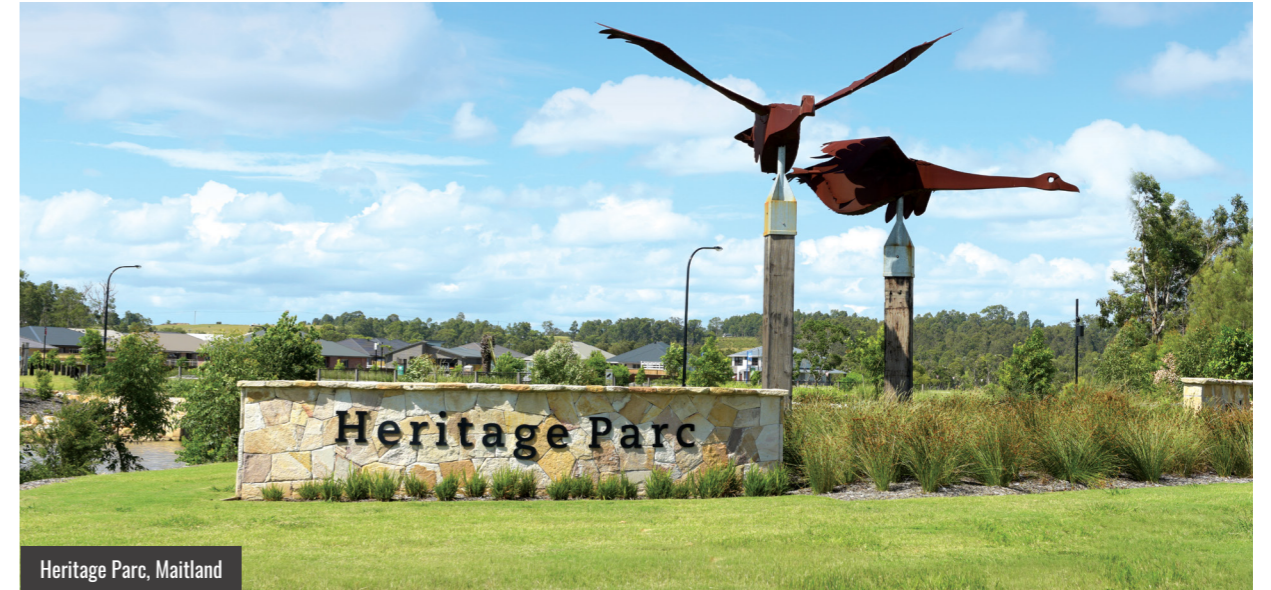
Heritage Parc, Maitland

A strong emphasis is place on creating exceptional living environments with open spaces, vibrant public art and aesthetically serene streetscapes. We build children's playgrounds, cycleways and plant mature street trees. Visit a McCloy community today to discover the difference for yourself.