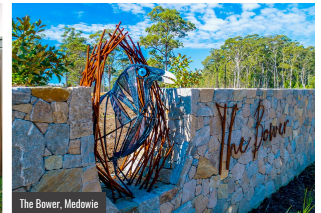
The Bower, Medowie

“ From the moment you drive in to Billy's Lookout, the quality speaks for itself and you know it is something special. From the statues of two massive Pelicans, to the detail which has been put into selecting the shrubs which line the streets, it is evident that not a dime has been spared. McCloy Group hasn't simply created a heap of blocks of land, but an amazing community. ”