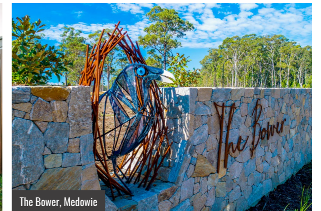
The Bower, Medowie

“ From the moment you drive in to Billy's Lookout, the quality speaks for itself and you know it is something special. From the statues of two massive Pelicans, to the detail which has been put into selecting the shrubs which line the streets, it is evident that not a dime has been spared. McCloy Group hasn't simply created a heap of blocks of land, but an amazing community. ”