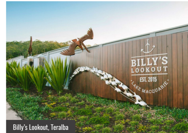
Billy's Lookout, Teralba