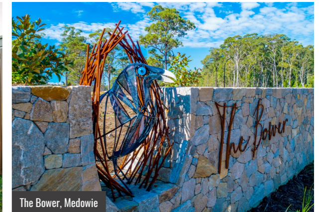
The Bower, Medowie

“ From the moment you drive in to Billy's Lookout, the quality speaks for itself and you know it is something special. From the statues of two massive Pelicans, to the detail which has been put into selecting the shrubs which line the streets, it is evident that not a dime has been spared. McCloy Group hasn't simply created a heap of blocks of land, but an amazing community. ”