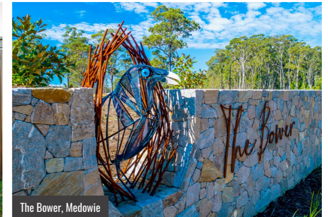
The Bower, Medowie

“ From the moment you drive in to Billy's Lookout, the quality speaks for itself and you know it is something special. From the statues of two massive Pelicans, to the detail which has been put into selecting the shrubs which line the streets, it is evident that not a dime has been spared. McCloy Group hasn't simply created a heap of blocks of land, but an amazing community. ”